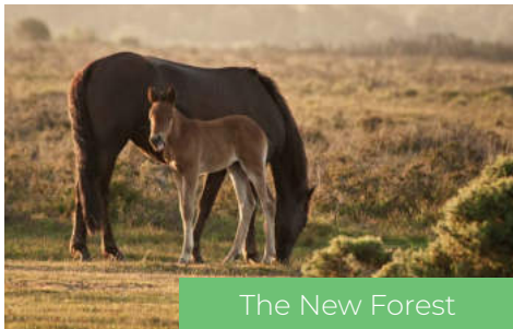
The New Forest