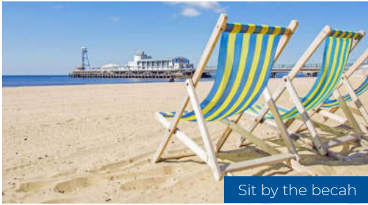
Sit by the beach