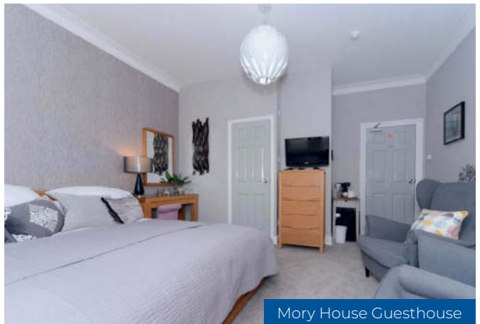
Mory House Guesthouse