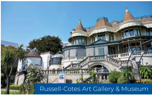
Russell-Cotes Art Gallery &amp; Museum