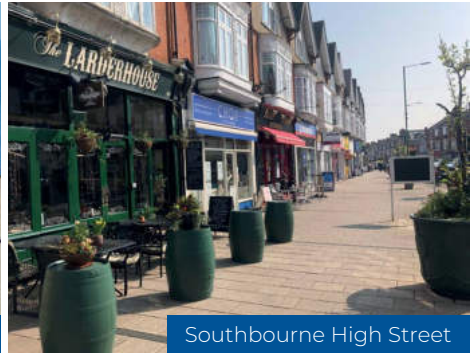
Southbourne High Street