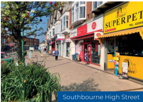
Southbourne High Street