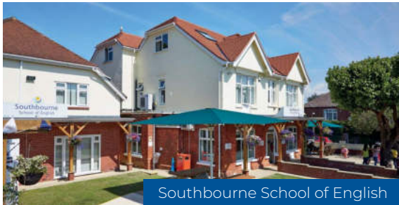
Southbourne School of English